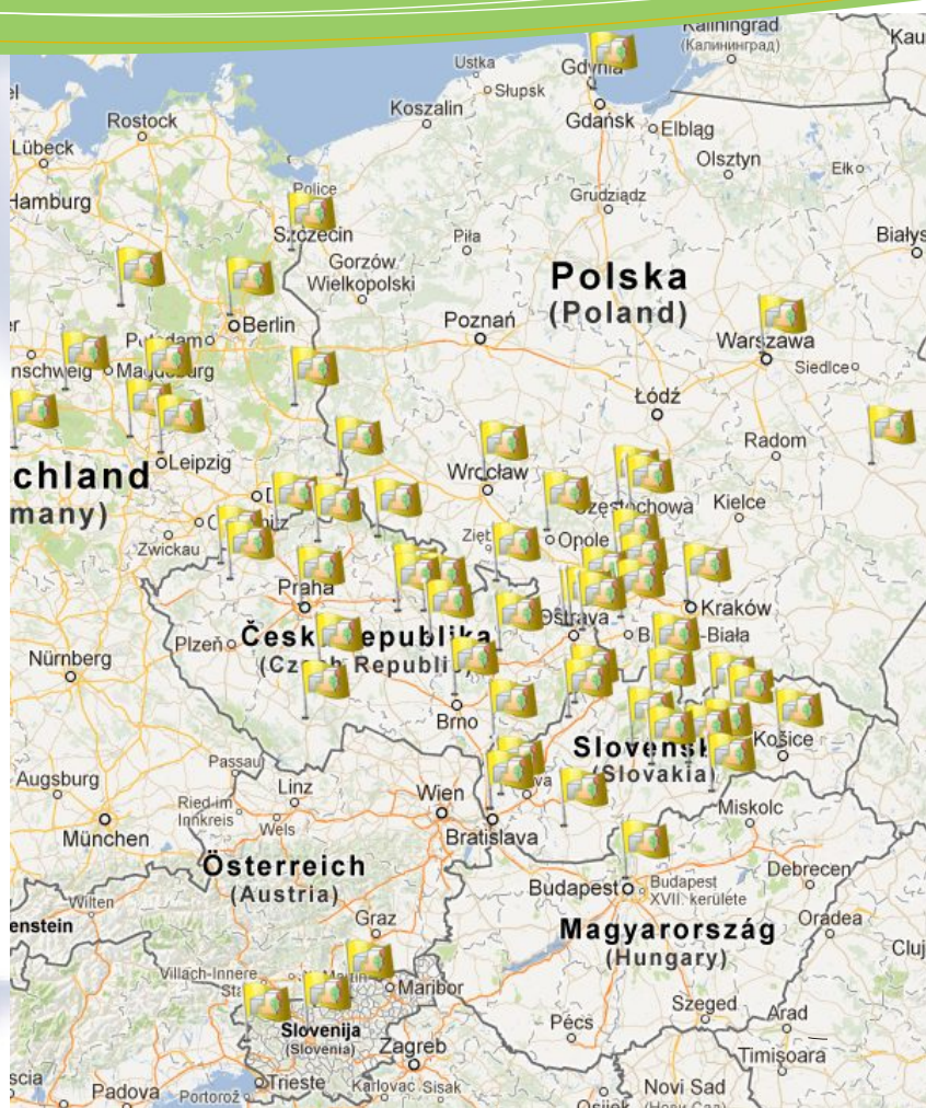
Locations of good practices and initiatives included in RNT databases

Project website: http://www.renewtown.eu/