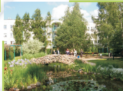
Backyard garden, Ursynów district