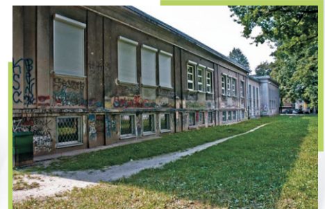
Nowa Huta in Cracow, Poland