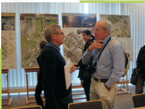
Meeting in Ursynów District Office