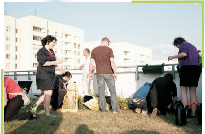
'Afternoon on the roof' workshop

Within the framework of the project, conferences, workshops and happenings are planned to be organized by artists, urban planners and cultural animators. This approach will provide the creative means of involving Targówek's diverse residents in the process of adapting and transforming the community's fabric. The conference opening the project was organized on June 17-18. During the conference one of the most interesting workshop was the: 'Afternoon on the roof' which aimed to show possibilities to develop housing or recreational function on the roof of typical socialist housing blocks.