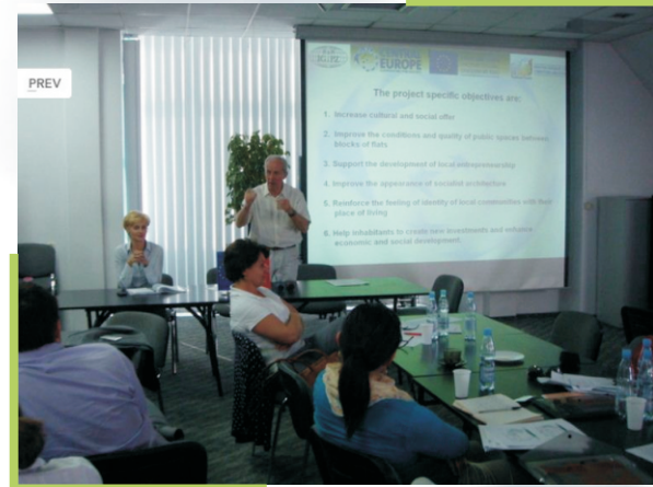
ReNewTown technical meeting