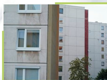
Ústí region, Czech Republic