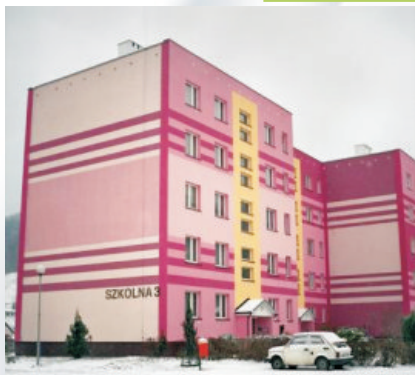
A bad example of the facade renovation

One of the fundamental problems of large housing estates of the socialist period is their ugliness, monotony and architectural monumentality.