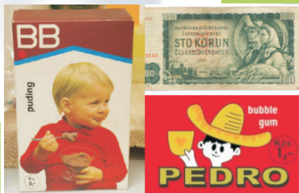
Examples of museum exhibits

The building, which is planned to be a museum, was built in 1985 by the citizens of Hnusta in frame of the program known as "Action Z", that is an action, where the citizens work on the building for free. Therefore the building is of great memorial value. It was primarily constructed as a grocery store for people living in the suburbs of Hnusta city – which offered supply of food without the need to travel to the center – core of the city. Nowadays there is no interest in investing in the building and it is therefore in the state of proceeding deterioration.