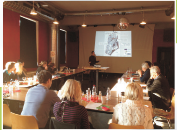
ReNewTown Team technical meeting

The technical meeting in Karlsruhe was held under the motto 'Urban Regeneration through Bonding' – both an important as well as a manifold topic on how decision-making processes in urban regeneration contexts are carried out, participation is realized and control is exercised.