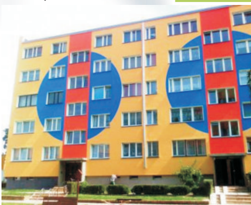
A bad example of the facade renovation

Unfortunately, the process occurs without a coherent strategy, often with strange colors of facades that transform Polish cities into patchy and aesthetically destroyed areas. The 'Mass Movement' (Pospolite Ruszenie) initiative aims to increase public awareness of this problem and to refurbish as many buildings as it is possible in order to change the image of the urban landscape in Poland.