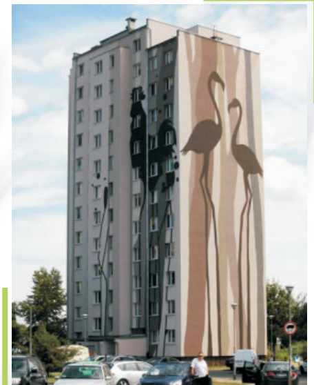
A good example of the facade renovation

The 'Pospolite Ruszenie' is a bottom-up initiative, which was created in 2011 by two young Polish artists L.U.C and Sokół. Its aim is to 'defeat the ugliness of post-communist public space in Poland' i.e. the gloomy, socialist realist housing estates and kitsch motley tower blocks and, consequently, regain the space from post-soviet indifference and passivity.