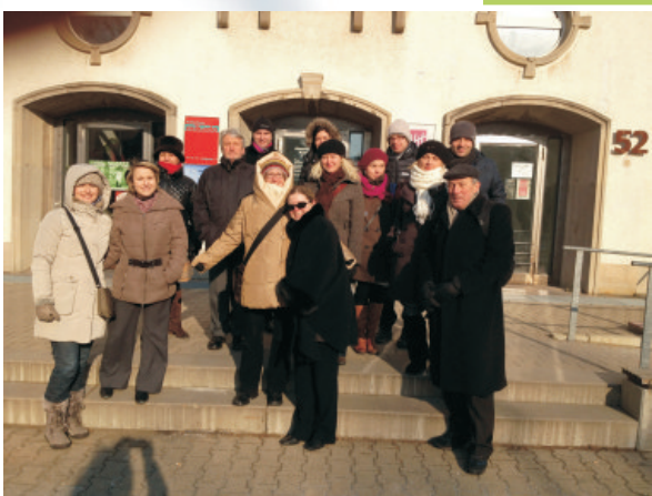
ReNewTown Team in Karlsruhe