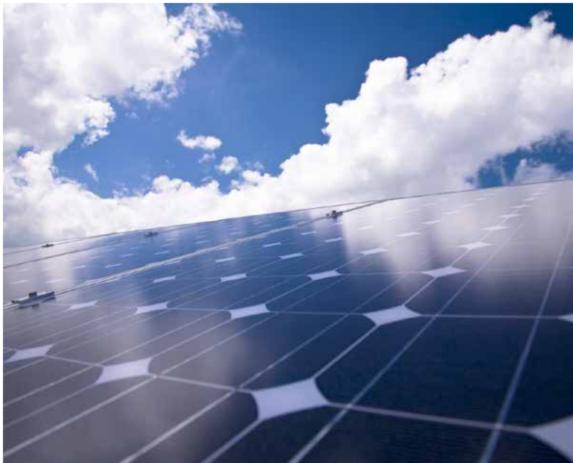
Building reflectors large enough to reflect significant amounts of solar energy presents an enormous technological challenge.