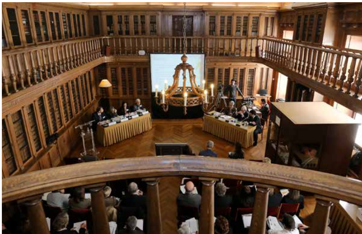
Lisbon, 18 January 2014: The PACITA policy hearing on Public Health Genomics in the Portuguese parliament brought together politicians, experts en TA practioners.

designed by undergrad student Gymrek - to expose vulnerabilities in databases that hold sensitive information on thousands of people around the world.